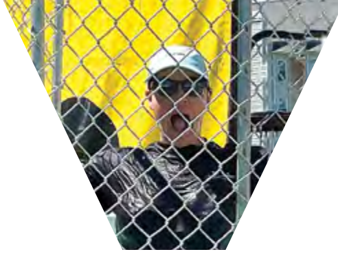
FY2022 KEY ACCOMPLISHMENTS

Westminster-Canterbury on Chesapeake Bay